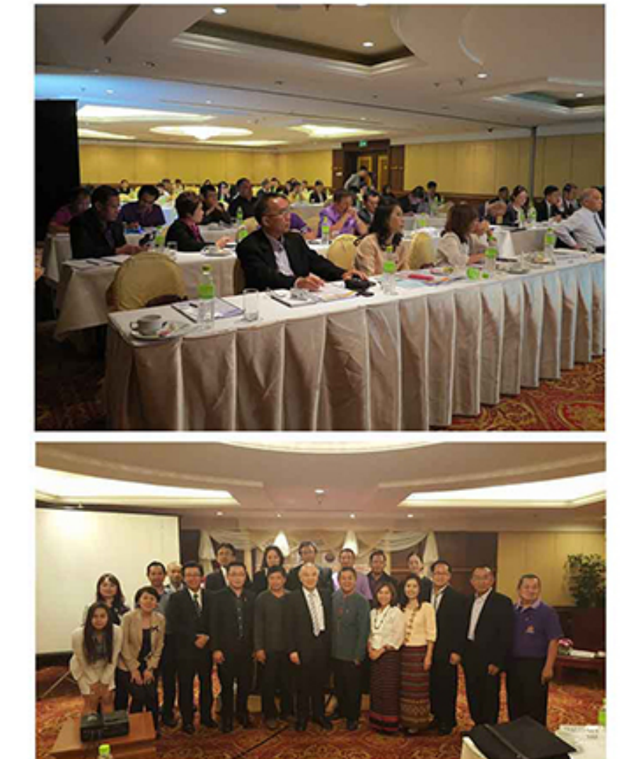
Kick-off seminar on 7th July 2016

First Planning Team Meetings were organized in October to November, where stakeholders discussed and identified critical problems and significant potentials and formulated vision statement as theme for SFCI Project.