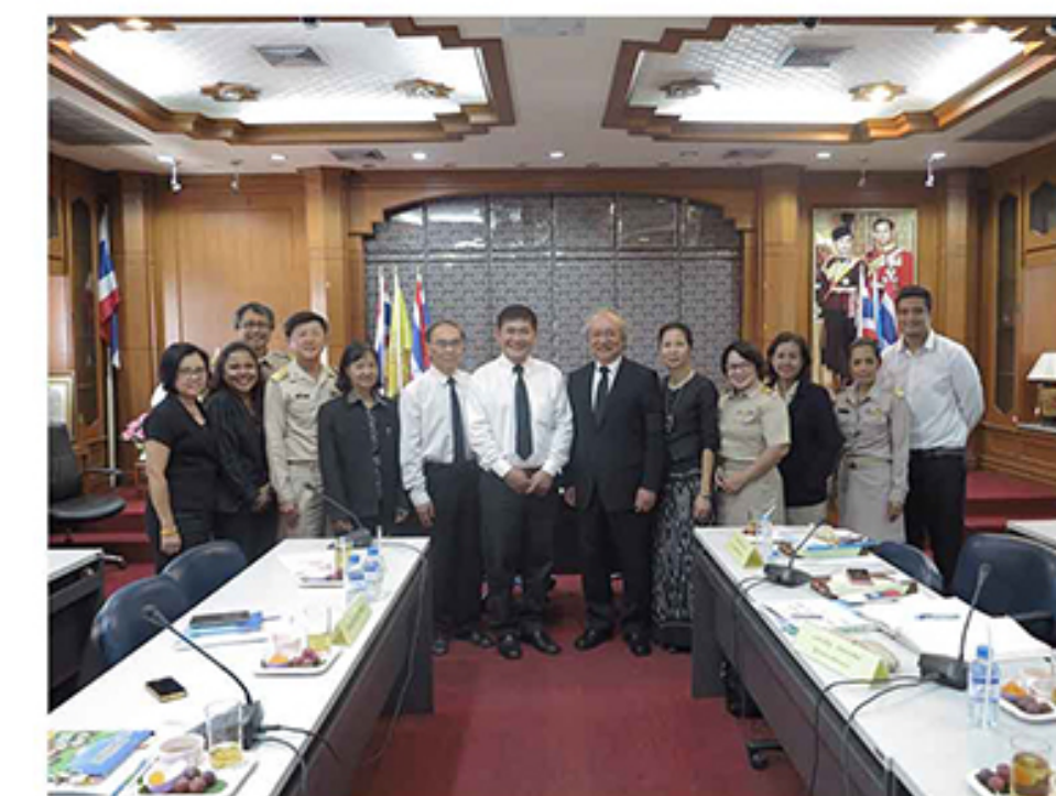
First Visit in Phitsanulok on 31 October 2016

It was decided that Phitsanulok joined the SFCI Project as the sixth city. After first kick-off discussion with Mayor of Phitsanulok on 31 October, it entered planning stage to catch up with other cities.